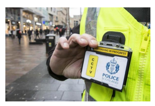
BWV trialled in North East Division

Body Worn Video (BWV) is a wearable device that can record audio and video. BWV devices come in a range of physical and technical designs, but ultimately perform the same basic functions. It is most commonly worn across the chest or mounted on a helmet.