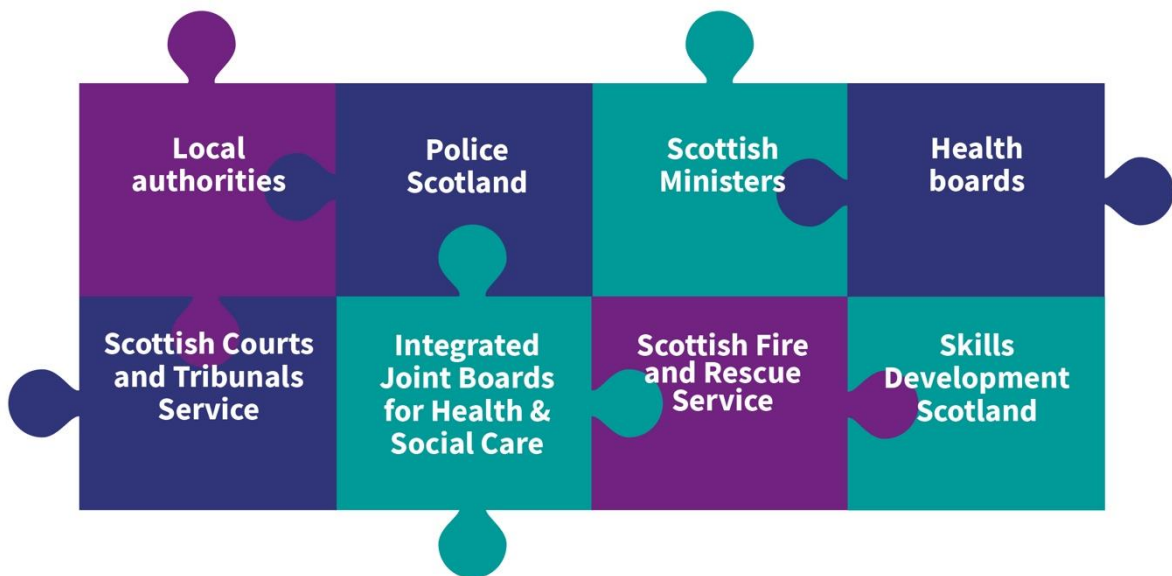
Figure 1 – Community justice statutory partners